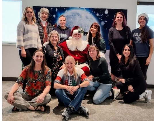
Fitness Staff Holiday Party