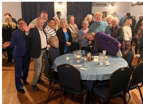
Adams Mystery Playhouse Trip