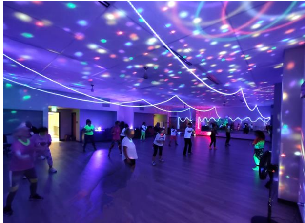
Zumba Glow at the Community Center