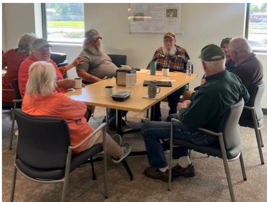
Patrons gathering before FF Lunch

Active Adult Check-ins: 698 Friendly Fork Lunches Served: 563