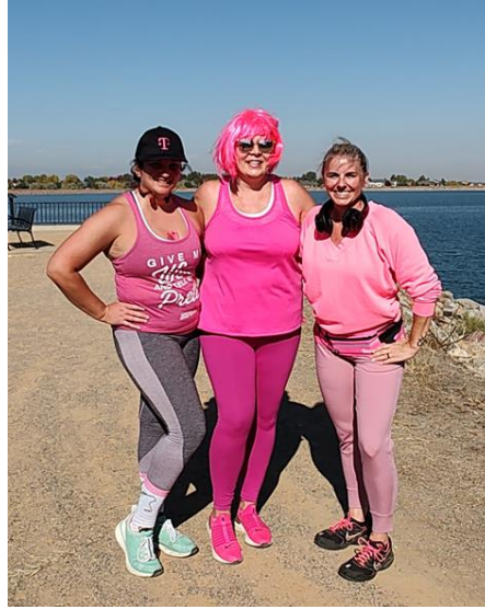
2024 Otter Trot

Total Group Fitness Participants Recreation Center: 1234 Total Group Fitness Participants Community Center: 1040