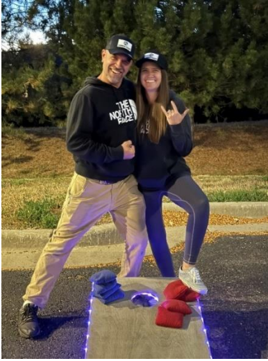
Fall League Champs: Beerly Legal