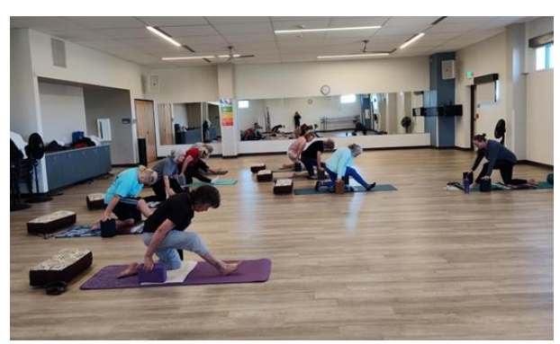
Gentle Yoga at Community Center

Total Group Fitness Participants Recreation Center: 1053 (Rec closed 8/23 and Aquatics through 9/8) Total Group Fitness Participants Community Center: 844